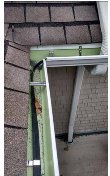
90° angle turns