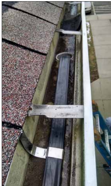
Clips in place