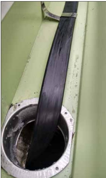
Flexible – Bends easily