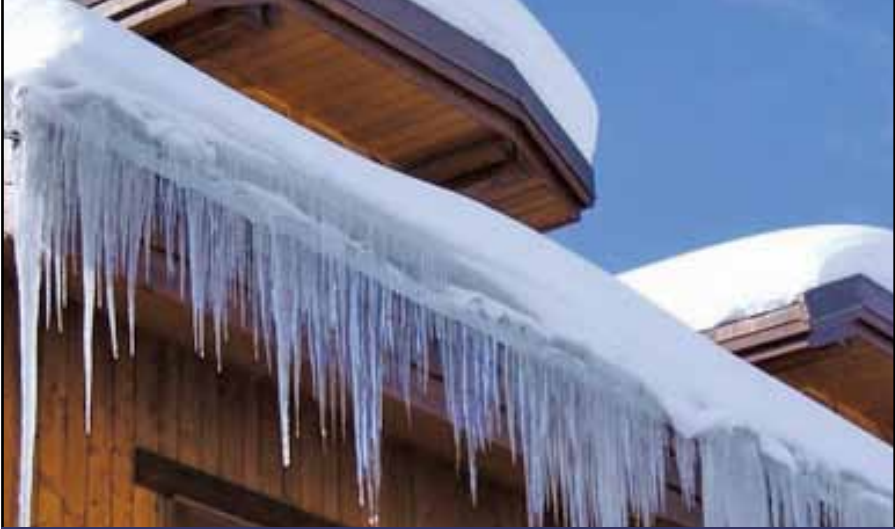
PREVENTS SNOW AND ICE BUILD-UP IN GUTTERS AND DOWNSPOUTS

Snow and ice prevention systems are essential for making gutters and downspouts clear of snow and icicles safer to reduce liability. Due to Calorique amorphous metal heating technology, installing and operating gutter and downspout ice/snow melting heating systems is practical and affordable. Easy to install, our robust heating system is designed for outdoor exposed environment applications for gutters and downspouts and to be used in conjunction with our Perfectly Clear Roof De-Icing System . This product is manufactured with UV and FR additives to withstand sunlight exposure and resistance to fire. No need for multiple runs in 4" - 6" Gutter.